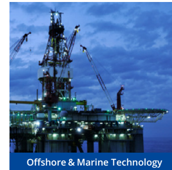
Offshore & Marine Technology