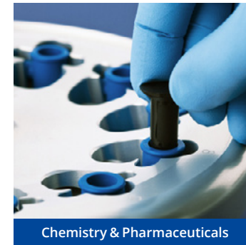
Chemistry & Pharmaceuticals